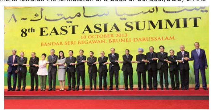
East Asia Summit (EAS)