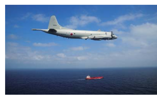
Patrol aircraft that works on caution monitoring