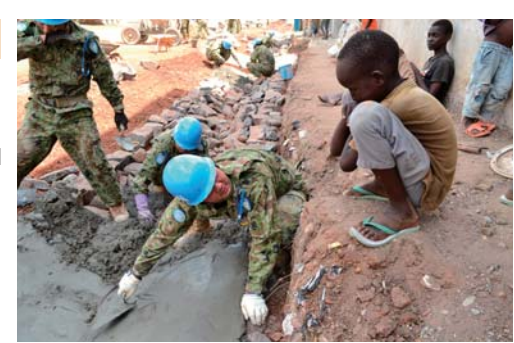
PKO in South Sudan