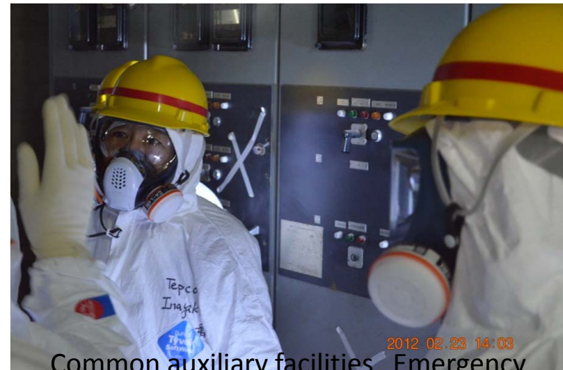
Common auxiliary facilities Emergency diesel generator power supply panel room for unit2