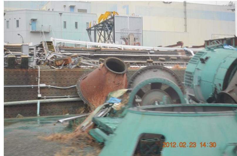
Sea water pump area of unit no.1-4