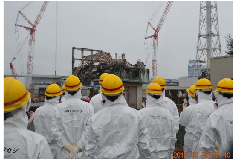
Unit 3 reactor building