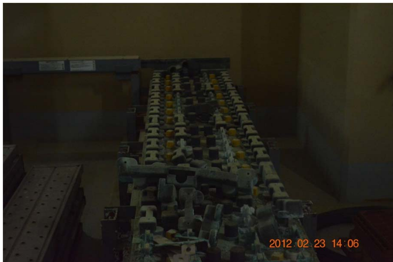
Common auxiliary facilities Batteries for the Emergency diesel generator