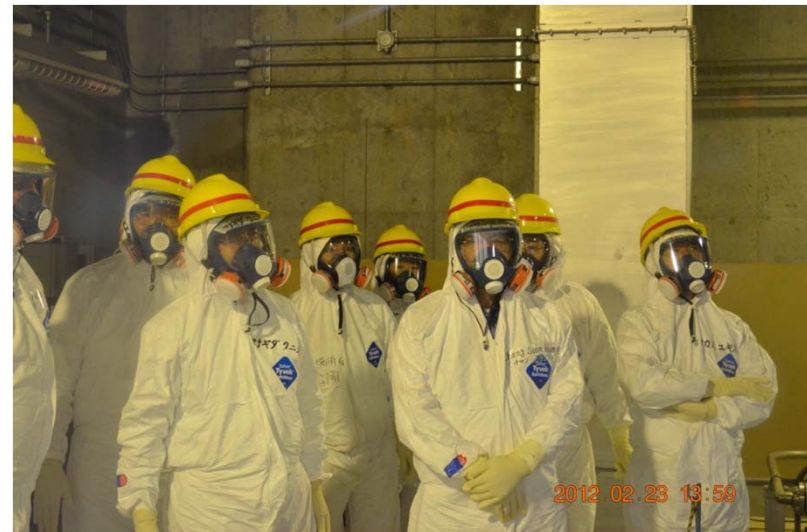
Common auxiliary facilities Emergency diesel generator room