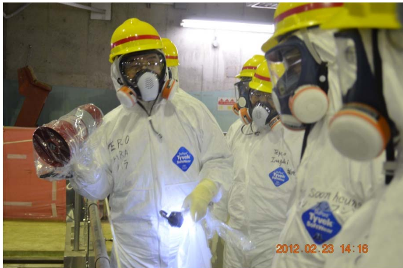
Common auxiliary facilities Operation floor