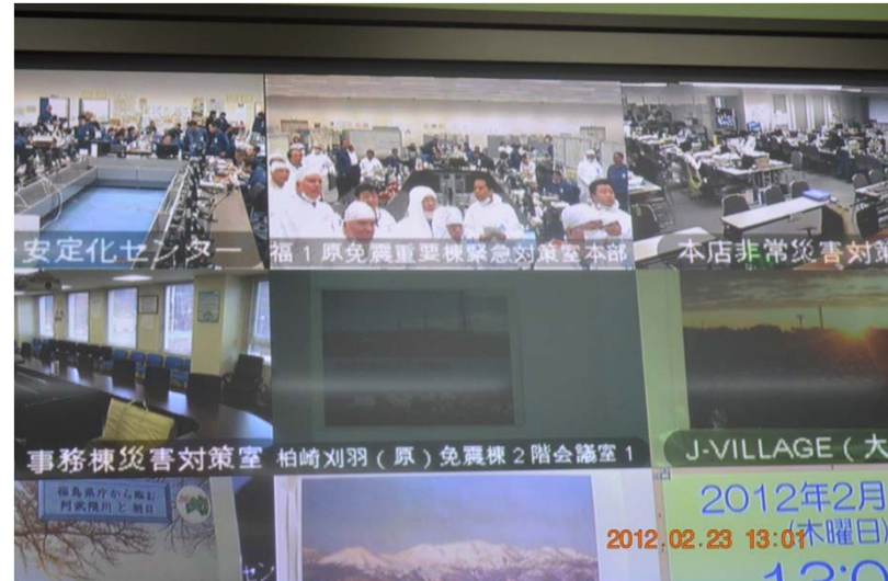
Seismic isolation building teleconferencing system