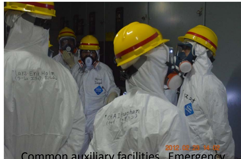
Common auxiliary facilities Emergency diesel generator power supply panel room for unit2