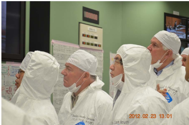
Seismic isolation building Emergency Response Office