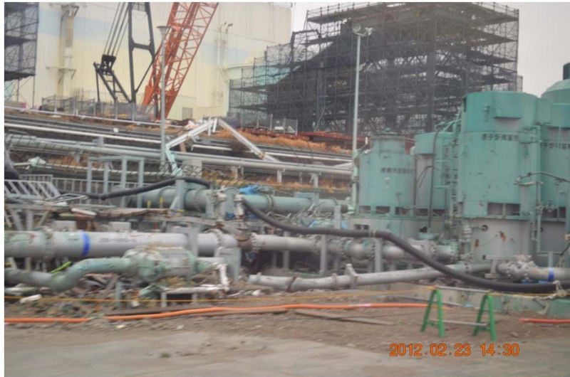
Sea water pump area of unit no.1-4