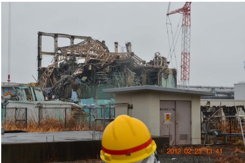
Unit 3 reactor building