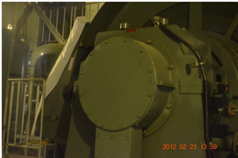
Common auxiliary facilities Emergency diesel generator