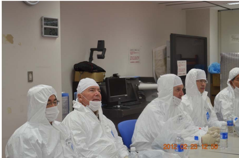
Seismic isolation building Meeting room