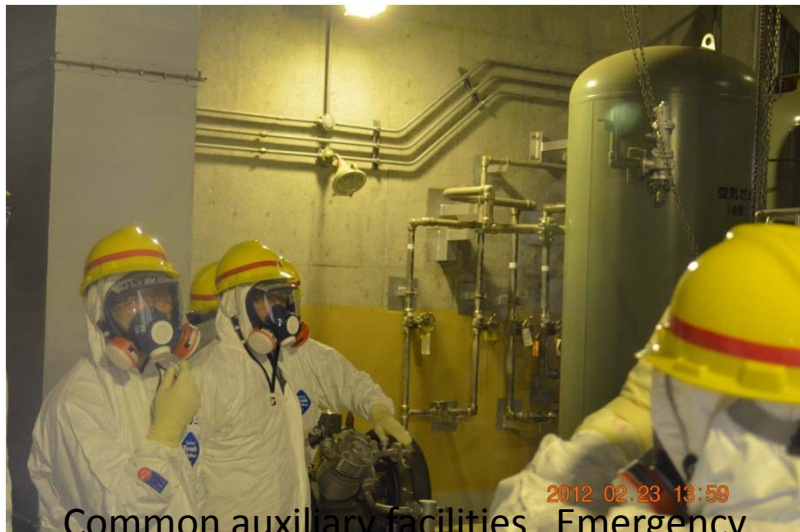
Common auxiliary facilities Emergency diesel generator room Starting Air Reservoir