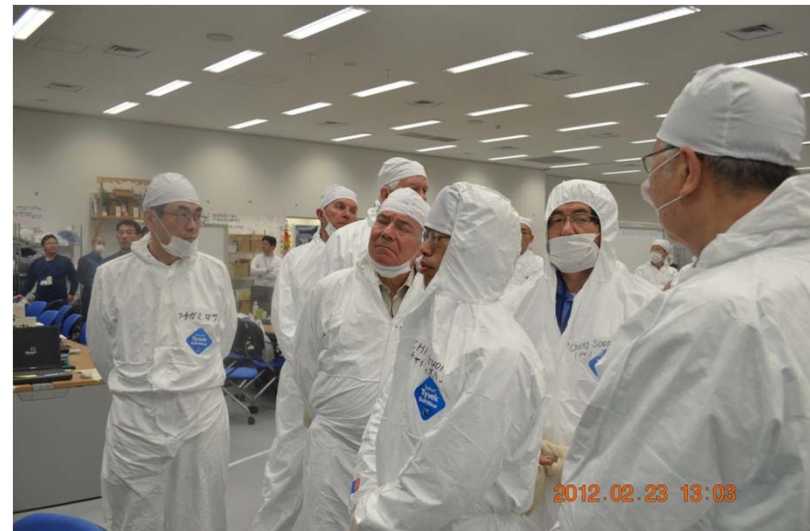
Seismic isolation building Emergency Response Office