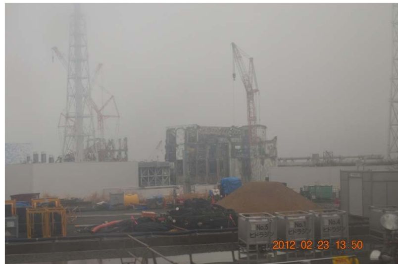
Unit 4 reactor building