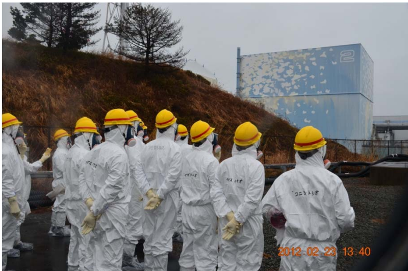
Unit 2 reactor building