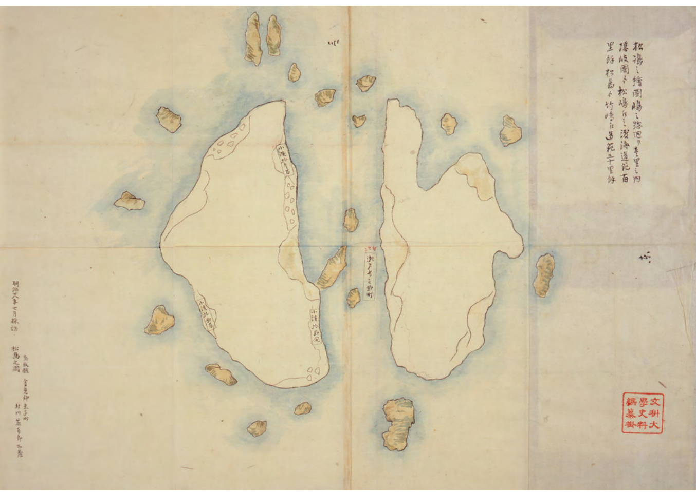
Repository: Historical Institute, The University of Tokyo