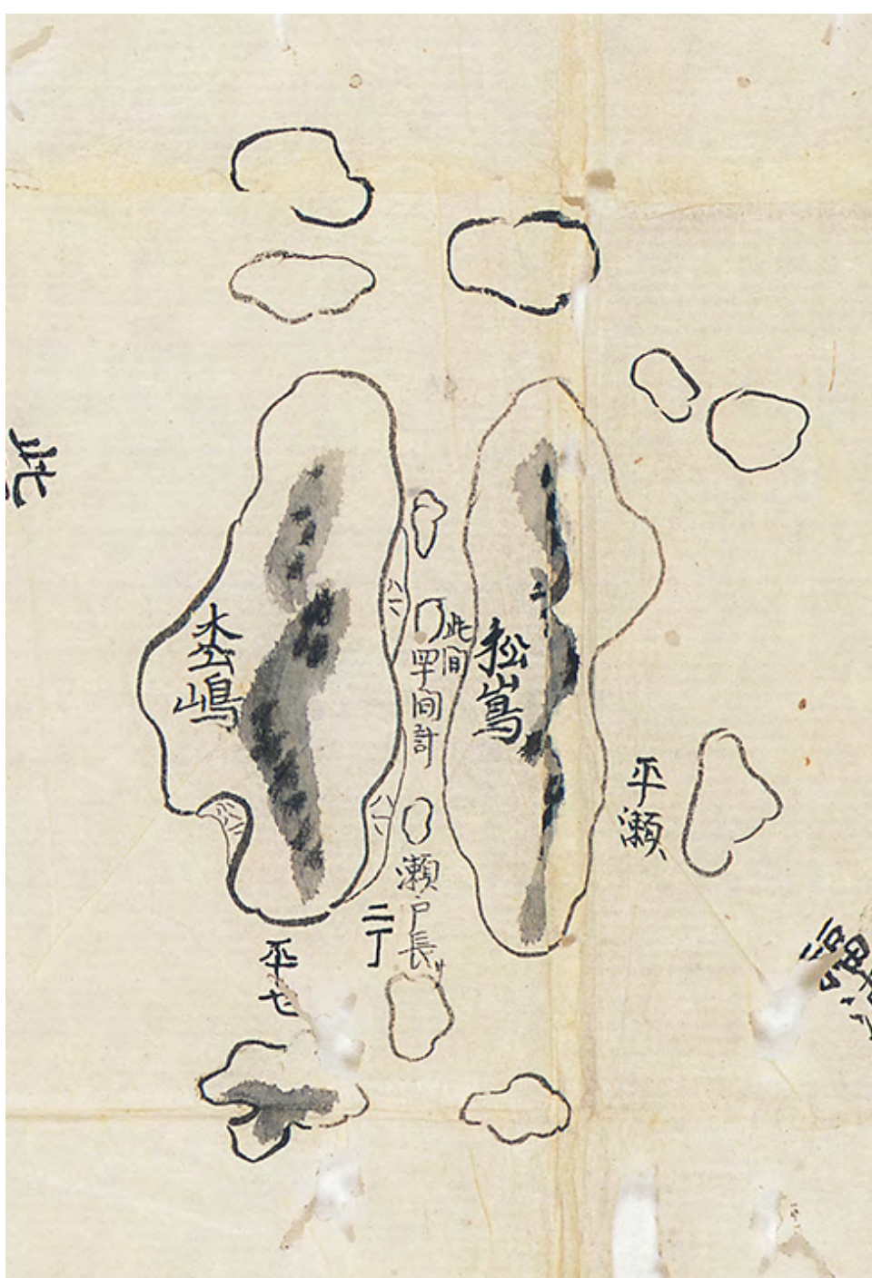
Repository: Tottori Prefectural Museum