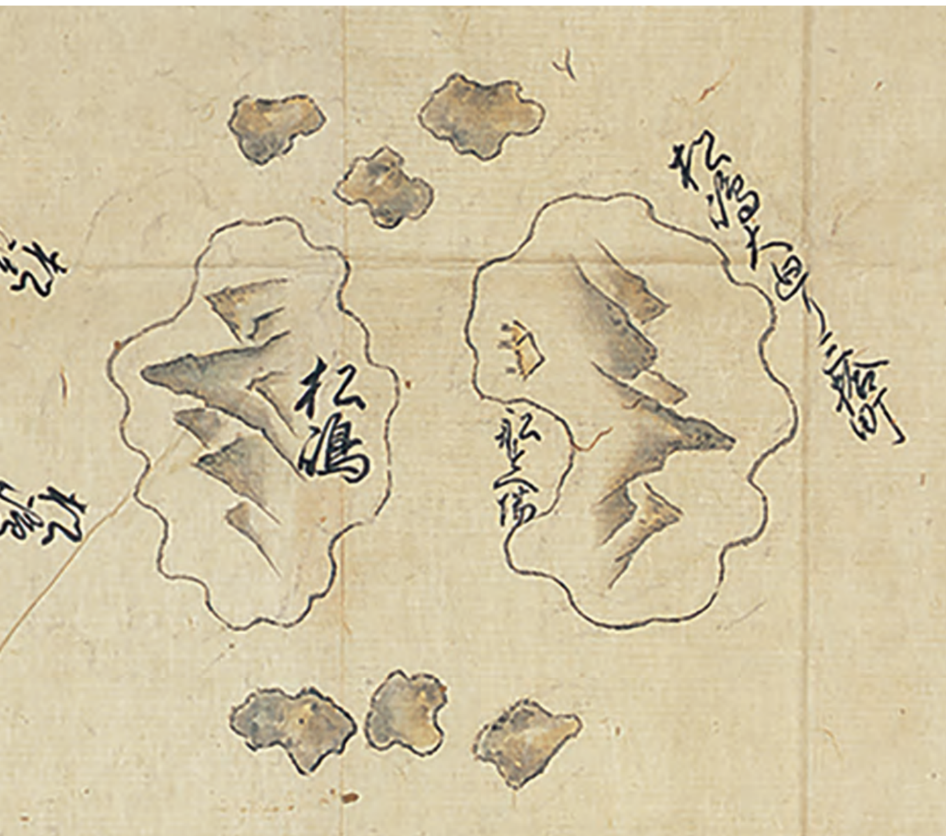
Repository: Tottori Prefectural Museum