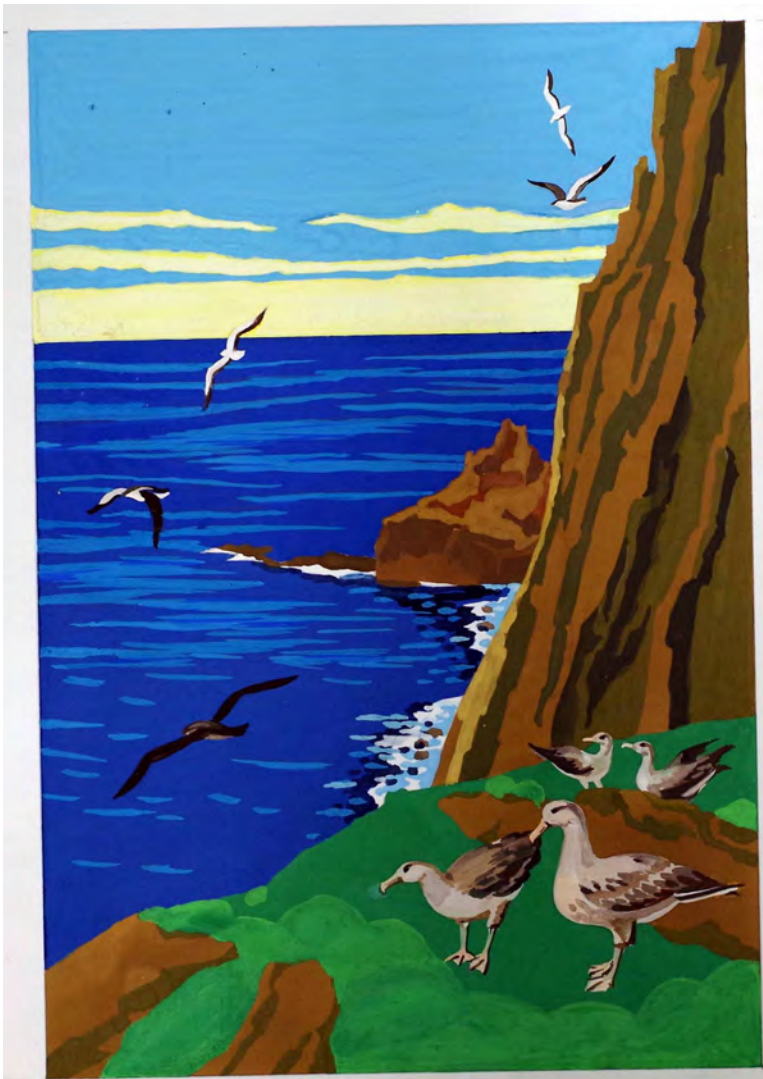
Design original plate

Repository: Okinawa Prefectural Museum and Art Museum