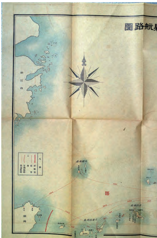
Okinawa Prefecture Shipping Route Map (Section)