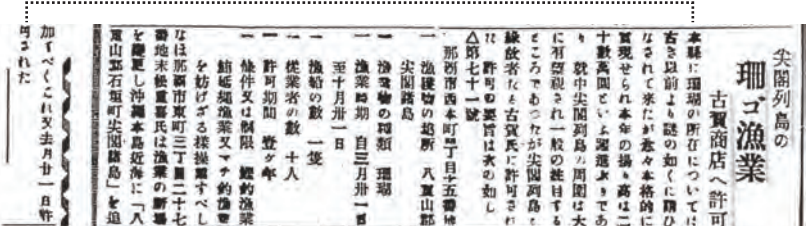
Repository: Ishigaki City Library

FY2015/P15 Article in Sakishima Asahi Shimbun dated July 3, 1935