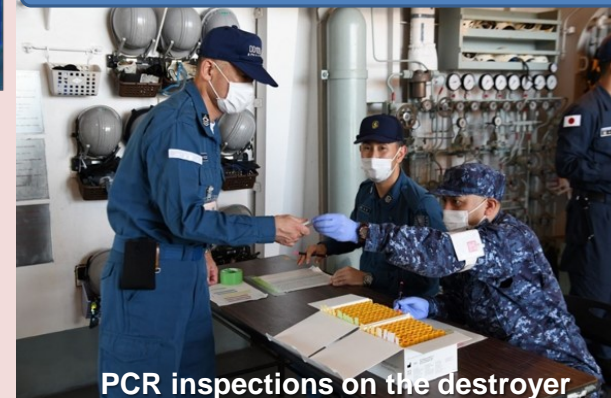
PCR inspections on the destroyer