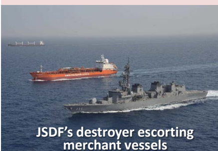
JSDF's destroyer escorting merchant vessels