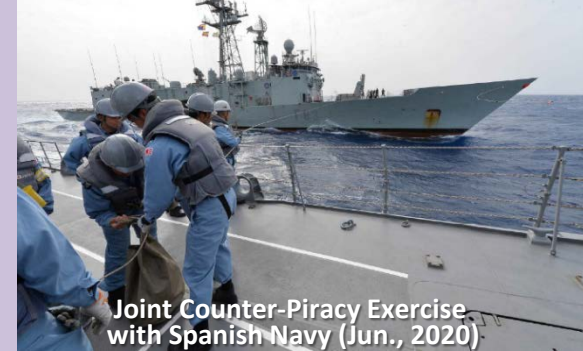
Joint Counter-Piracy Exercise with Spanish Navy (Jun., 2020)